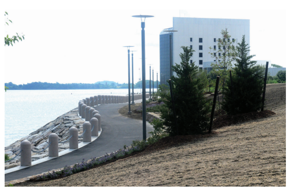
The new section of the HarborWalk opened to the public in July.

A new section of the HarborWalk between the JFK Library and Museum and Harbor Point Apartments has opened to the public. The 800-foot stretch of shoreline on the north side of the UMass Boston campus features a paved walkway, benches, lighting, gathering spaces, an area to display artwork, bike racks, and signs with historical narratives. The construction project began last summer, placing 3,200 tons (6.4 million pounds) of stone along the shoreline to stabilize it before adding the walkway and other amenities. A significant amount of granite blocks unearthed from the Big Dig was donated by the Massachusetts Department of Transportation. A formal dedication is scheduled for September 21.