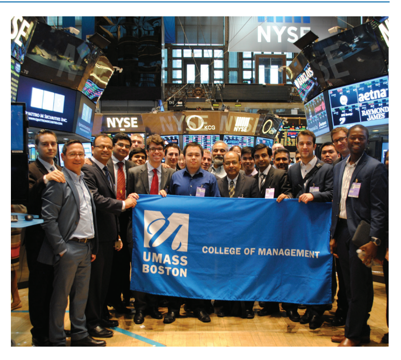
Students from the College of Management at the New York Stock Exchange.

The College of Advancing and Professional Studies also collaborated with the EMK Institute on a professional development session for teachers using the innovative Senate Immersion Module. The goal was to deepen participants' understanding of the legislative process and to develop new techniques for delivering content. The August workshop focused on Comprehensive Immigration Reform.