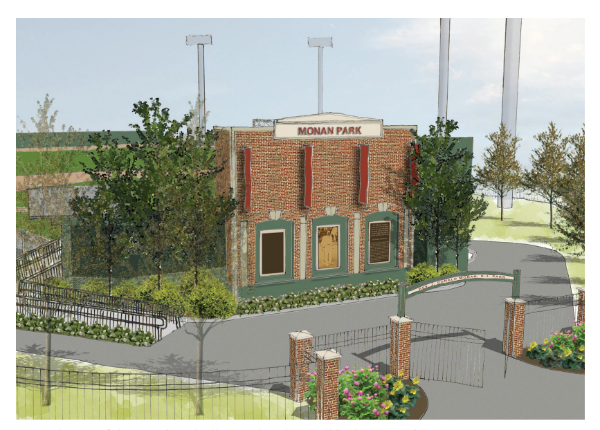
A rendering of the new baseball complex that will be home to the UMass Boston Beacons.